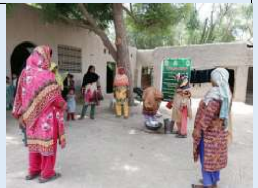
COVID=19 Awareness Sessions at District Khairpur