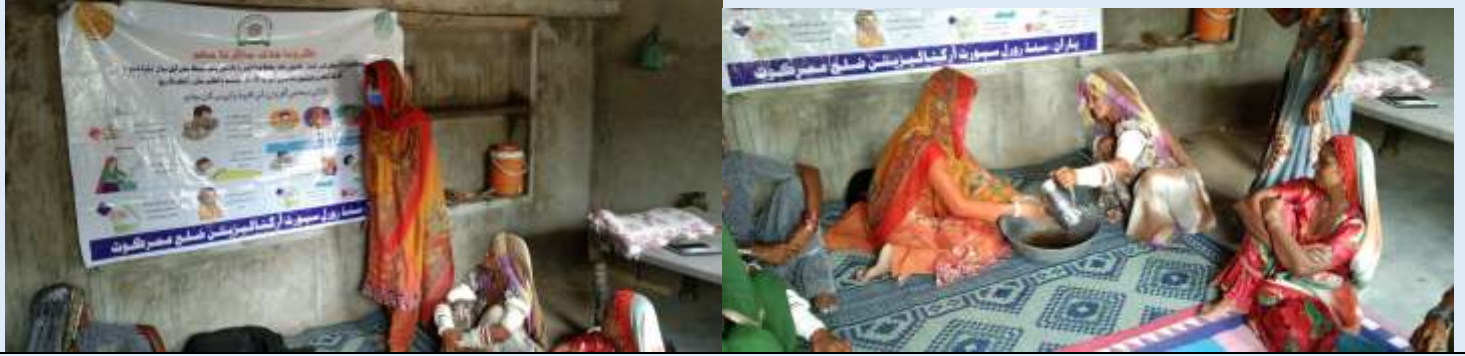
COVID-19 Sessions and Hand Washing Activity at District Umerkot