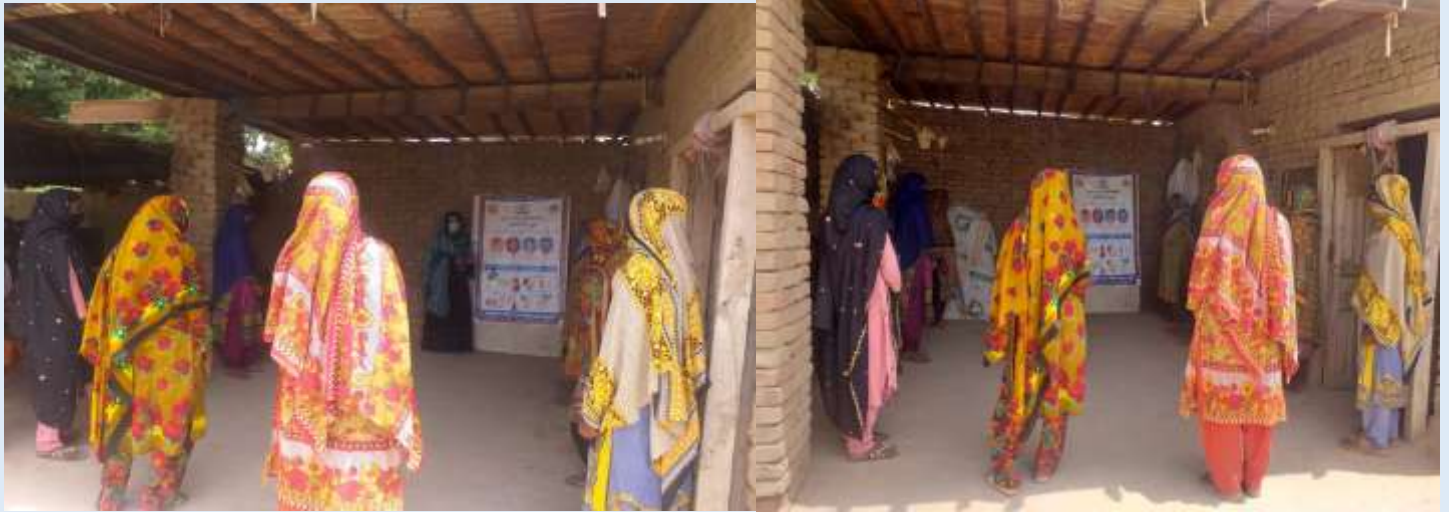
COVID-19 Awareness Session and Hand-washing activity at District Ghotki