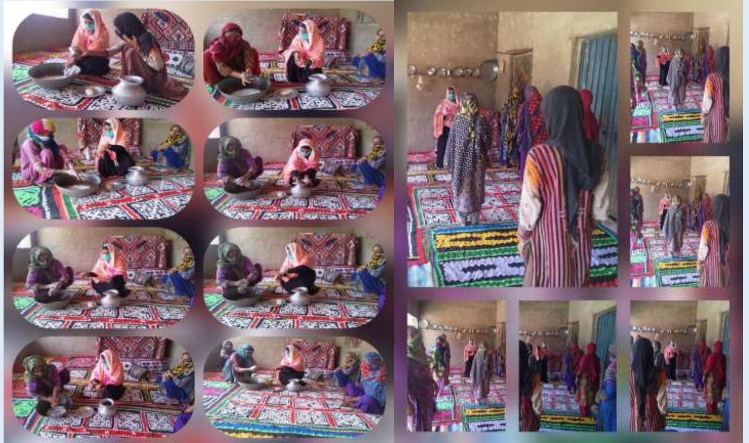
COVID-19 Awareness Sessions at District Nasuhoro Feroz