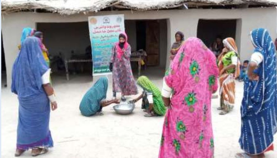
COVID-19 Community based Sessions at District Mirpurkhas