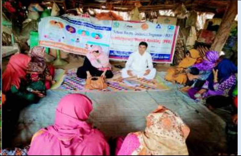
COVID-19 Awareness sessions and CRPs Training on COVID-19 at District Shikarpur